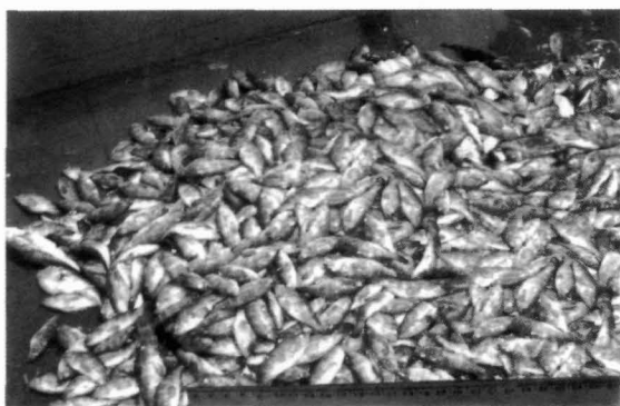
Fig.1. Juveniles of Epinephelus diacanthus landed in shrimp trawlers at Neendakara Fisheries Harbour, Quilon, Kerala.

weight varying from 15-43g were used. The length weight relationship was estimated as \text{Log } W = -5.421865 + 3.26 \text{ Log } L ( r = 0.9193 ).